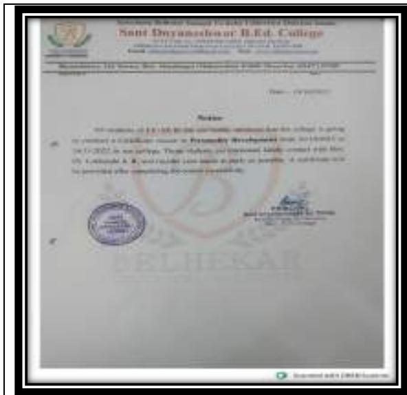
Notice of the Course