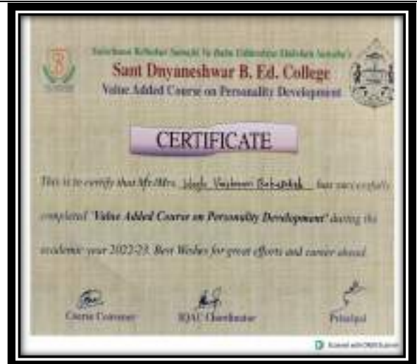
Certificate of the Course