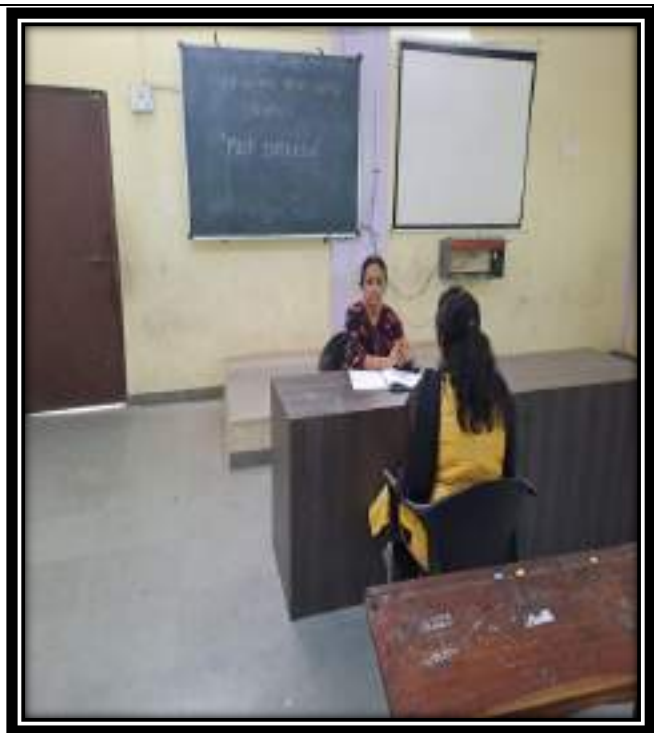
Mock Interviews of the Students