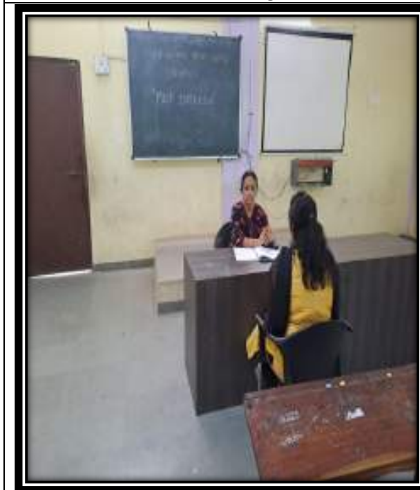
Mock Interviews of the Students