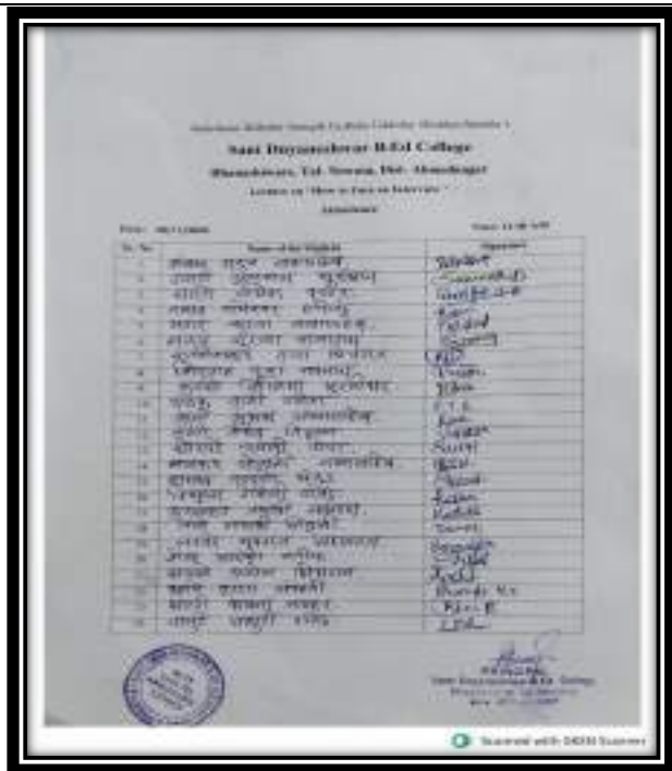
Attendance of the Students