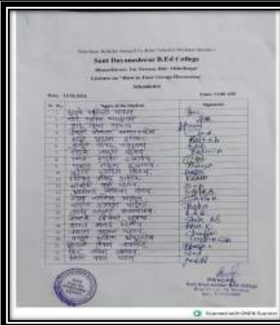
Attendance of the Program