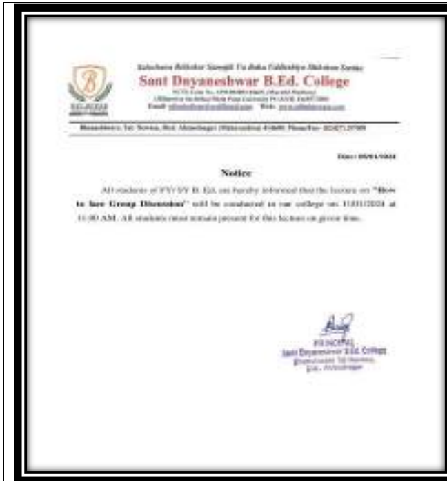
Notice of the Program