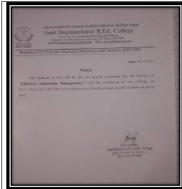
Notice of the Program