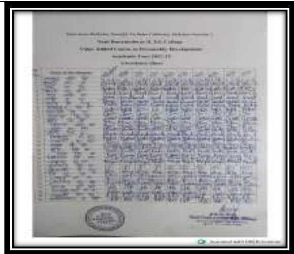
Attendance of the Course