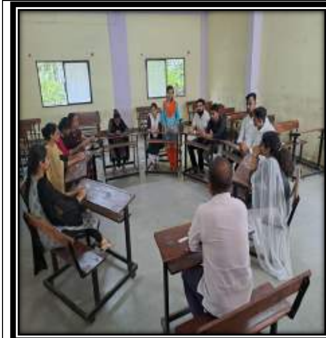
Participated Students in Group Discussion Session