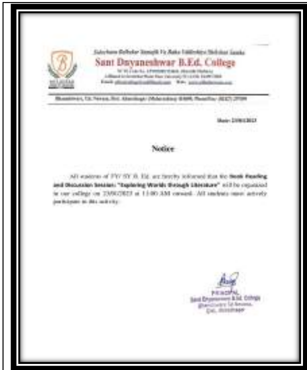
Notice of the Program