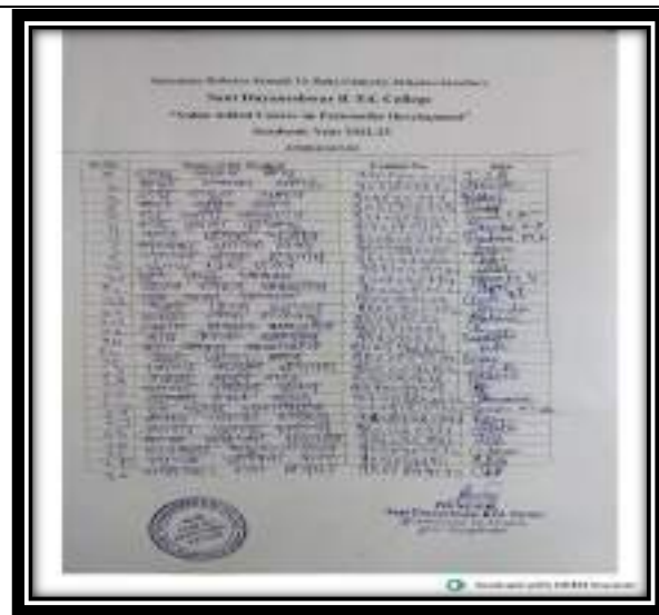
Admission list of the Course