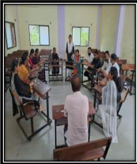
Speaker while giving tips on How to face Group discussion