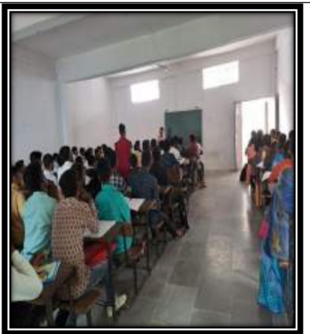
Lecture on Effective Classroom Management